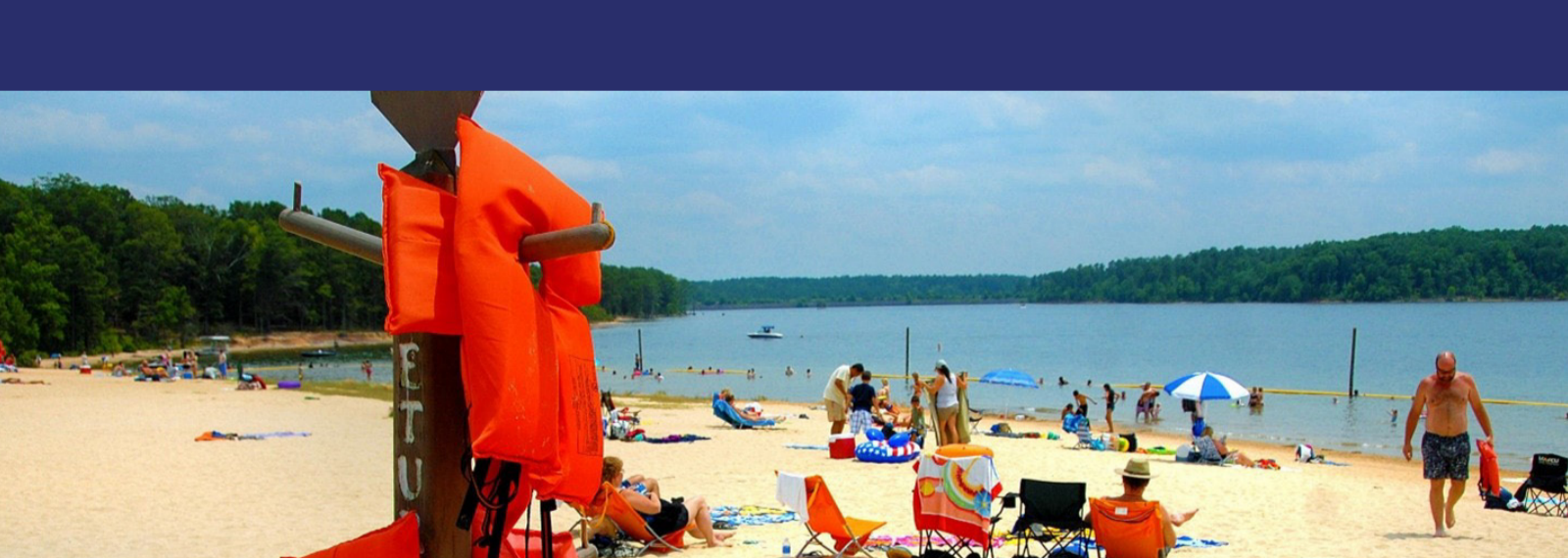
NC Division of Parks and Recreation, Jordan Lake State Recreation Area, Staff Photo

If you're looking for the perfect place to escape the hustle and bustle of the Triangle, try Jordan Lake. You may feel as if you've stepped into an undiscovered oasis of fun. Year-round, it's a popular destination for fishermen, hikers, and outdoor enthusiasts. It's conveniently located - even those just looking for an afternoon away from city life can enjoy all Jordan Lake has to offer. During the summer, visitors can take advantage of the seven beaches located along the lake. In the colder months, there are over 14 miles of hiking trails with options for all levels of hikers.